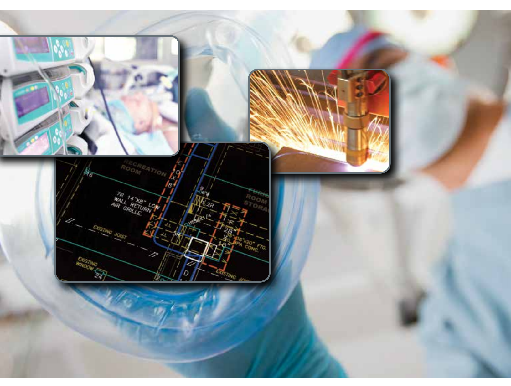
Airflow Sensors AWM700 Series, Compensated/Amplified