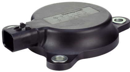
TARS-IMU: Transportation Attitude Reference Sensor (TARS) Ruggedized Inertial Measurement Unit (IMU)

One feature all construction implements share is that the quality and efficiency of work done with them is closely related to the experience and ability of the operator. A highly skilled operator can use a tool to deftly operate a piece of machinery to finish a job to specification and on time, saving cost and creating efficiency. However, the number of highly skilled operators has shrunk, making an expert operator few and far between. In spite of this, work and construction projects must proceed.