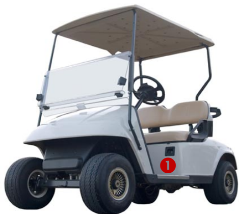
Figure 1. Golf Cart

1 Reverse alarm – sounds when lever is moved to “reverse” setting