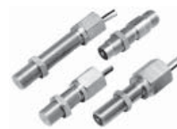
VRS Hazardous Location Series