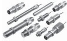
VRS High Output Series