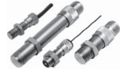
VRS High Temperature Series