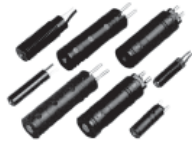
VRS Plastic Molded Series