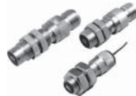
VRS High Resolution Series