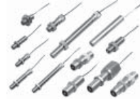
VRS Power Output Series